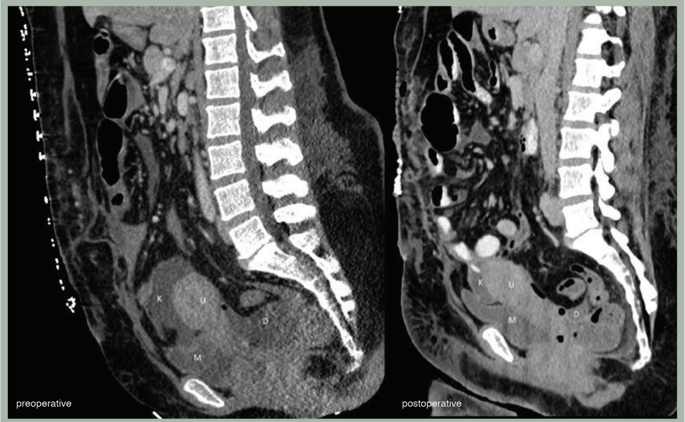
Figure 2. Sagittal section demonstrating preoperative and postoperative views